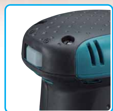
•Conveniently located ON / OFF Switch for One-Handed Operation.

•Rubber Switch Cover prevents ingress of dust.